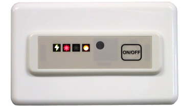
RECEIVER INDICATOR PANEL