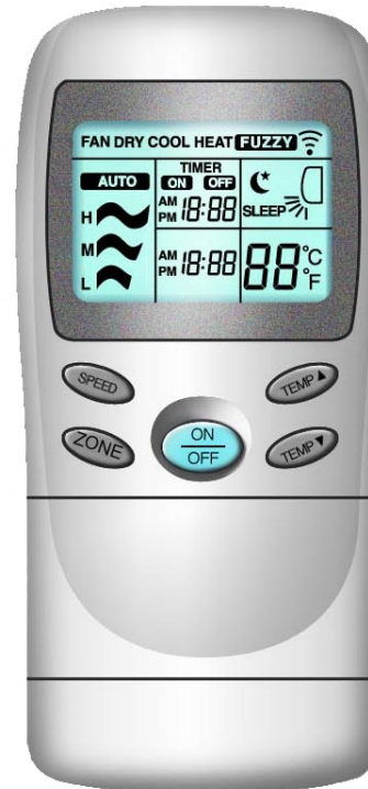
LCD-2001-D AIR CONDITIONING CONTROLLER