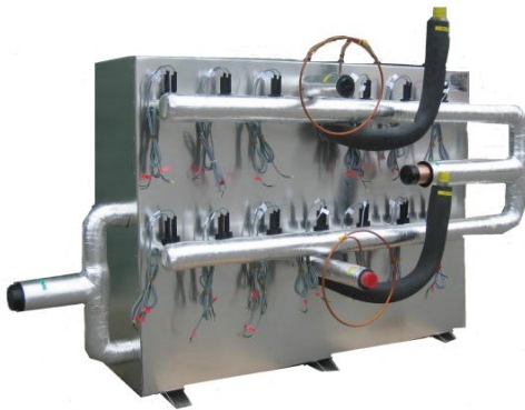
200 kW FRESH WATER CHILLER TO CHILL WATER TO 0.5°C