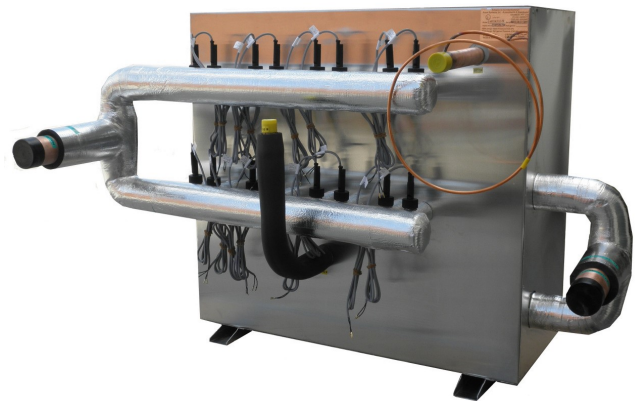
AQUA SYSTEMS 60 kW FRESH WATER CHILLER TO CHILL FRESH WATER TO 0.5°C