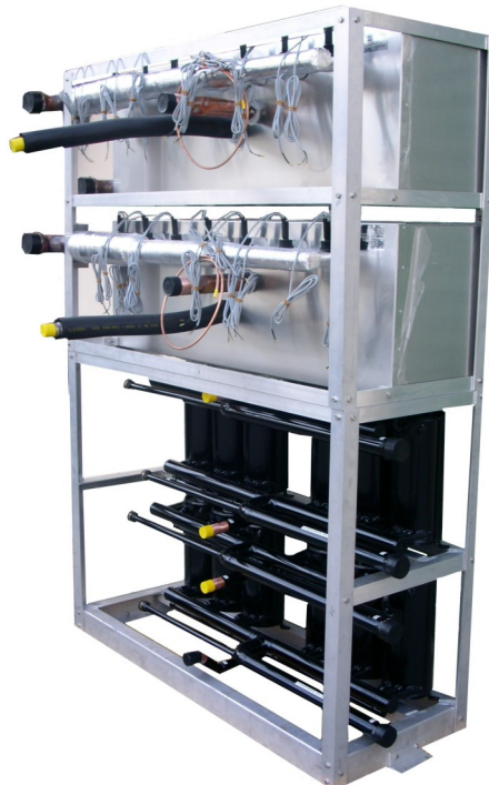
AQUA SYSTEMS LIQUID CHILLING EVAPORATOR WITH MINI FLOW SWITCHES FOR CHILLING FRESH WATER TO 0.5°C.