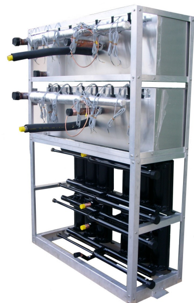
Combination marine sea water cooled condenser & liquid chilling evaporator for a 200 kW liquid chiller on a luxury cruise vessel