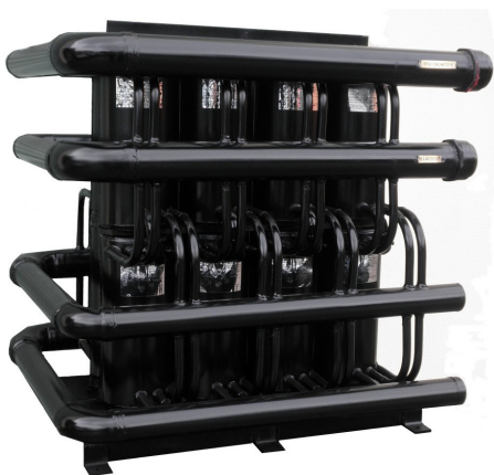
Aqua Systems “CN” series 480 kW marine water cooled condenser