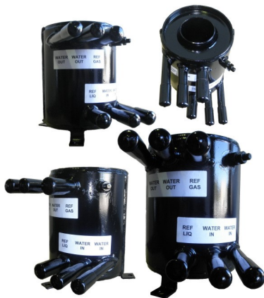
“CN” Series vertical marine sea water cooled refrigerant condensers