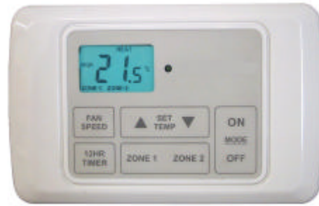
WCS-201Z Wall Control Plate

CONTROL OPTIONS – WATER COOLED COOL/ELECTRIC HEAT. WATER COOLED REVERSE CYCLE. CHILLED WATER / ELECTRIC HEAT. CHILLED WATER / HOT WATER HEATING.